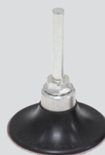
2" Disc Sanding Pad

Just screws an abrasive disc clockwise onto the pad for installation.